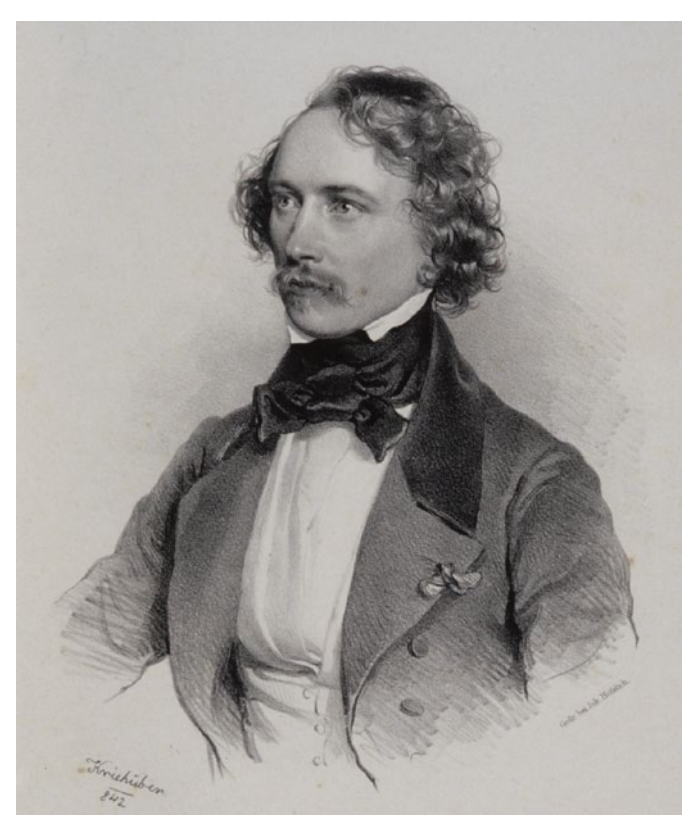
The better known portrait of François Servais by Josef Kriehuber, Vienna, 1842

So far no fewer than thirty-three different pictures of Servais have been discovered: two paintings, two engravings, nine drawings and water colors, eight lithographs and twelve photographs. Who will be the finder of the thirty-fourth picture?