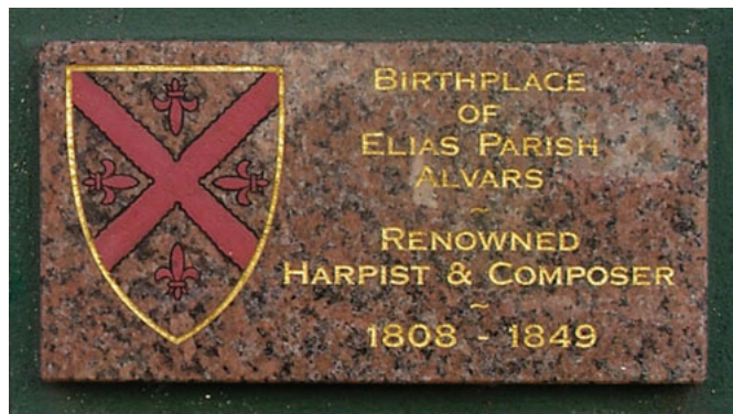
Commemorative plaque on a wall of his birthplace

France... From 1836 till 1842 he lived in Vienna. Afterwards he resumed his travels all over Europe. The 1848 revolution landed him in financial troubles, which indirectly resulted in his having his health deteriorate, so he died prematurely in the Austrian capital on January 25 1849. Also these days Parish Alvars is still a celebrity in the world of virtuoso harp music.