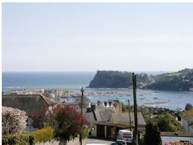
Bird's eye view of Teignmouth