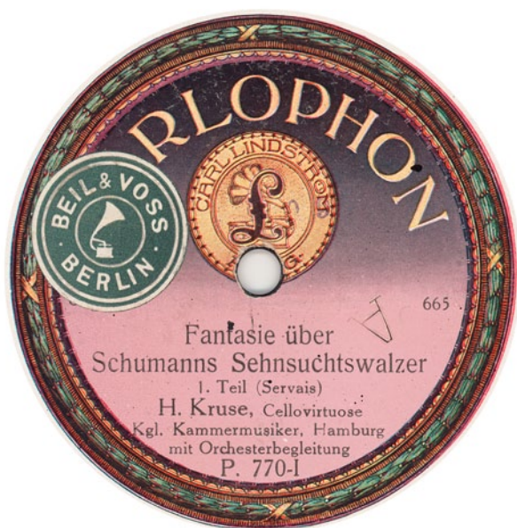
Detail of the newly acquired record (Parlophon 665/6, ca.1920)

with * in the discography on www.servais-vzw.org . In addition the collection possesses scores of recordings, not (yet) brought out so far.