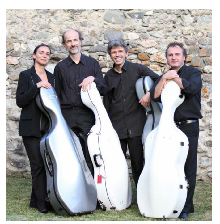
Cello master classes with the Tansman Quartet Friday April 11th till Sunday April 13th Servaisacademie, Kardinaal Cardijnstraat 7, 1500 Halle

Between April 11th and 13th the Tansman Quartet will be staying in Halle. They will conduct master classes at the "Servaisacademie" for three successive days. Cello players of all levels and ages are welcome. People will be given an opportunity to listen to the "masters" during the 16th Servais Concert and to the participants during their final performance on Sunday afternoon. Those who want to explore Halle as the Servais town can join in with a Servais sightseeing tour and pay a visit to the Servais rooms of the "Zuidwestbrabants Museum".