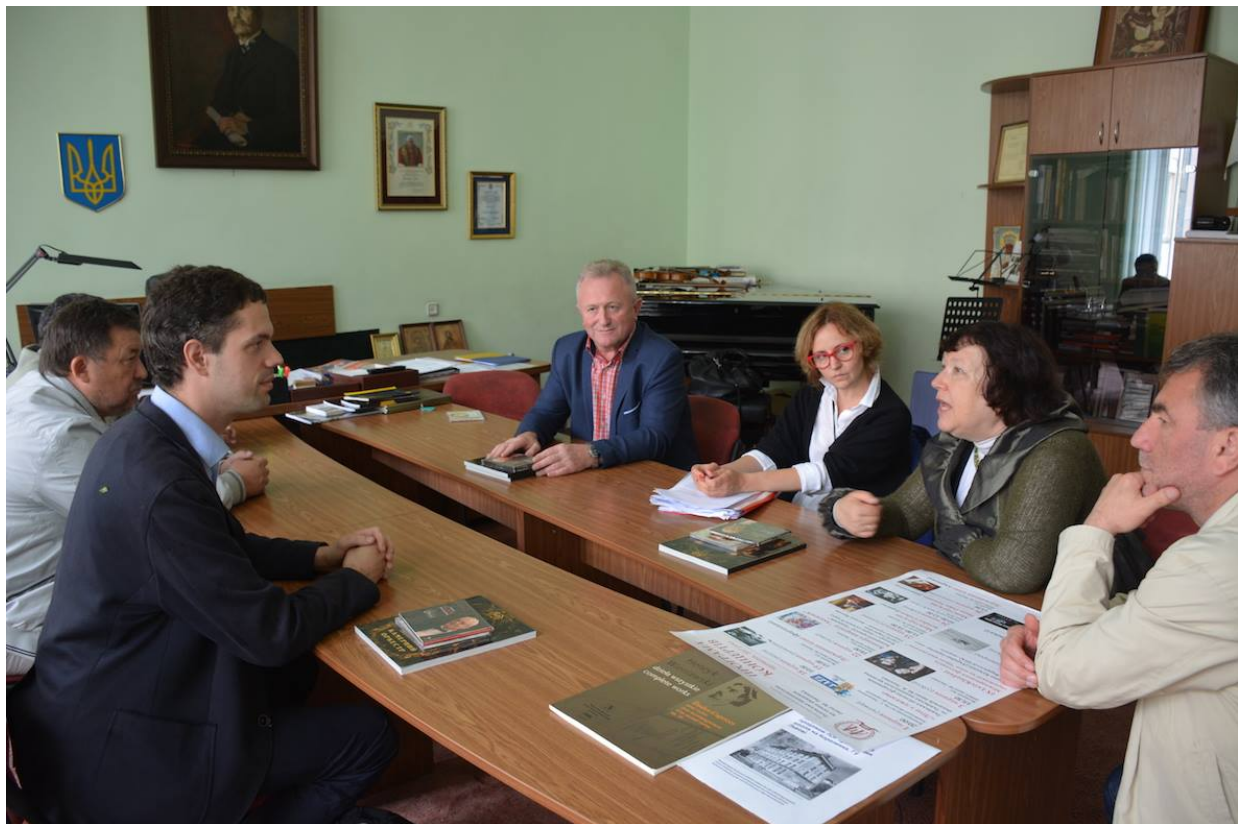
Musical Academy Lviv