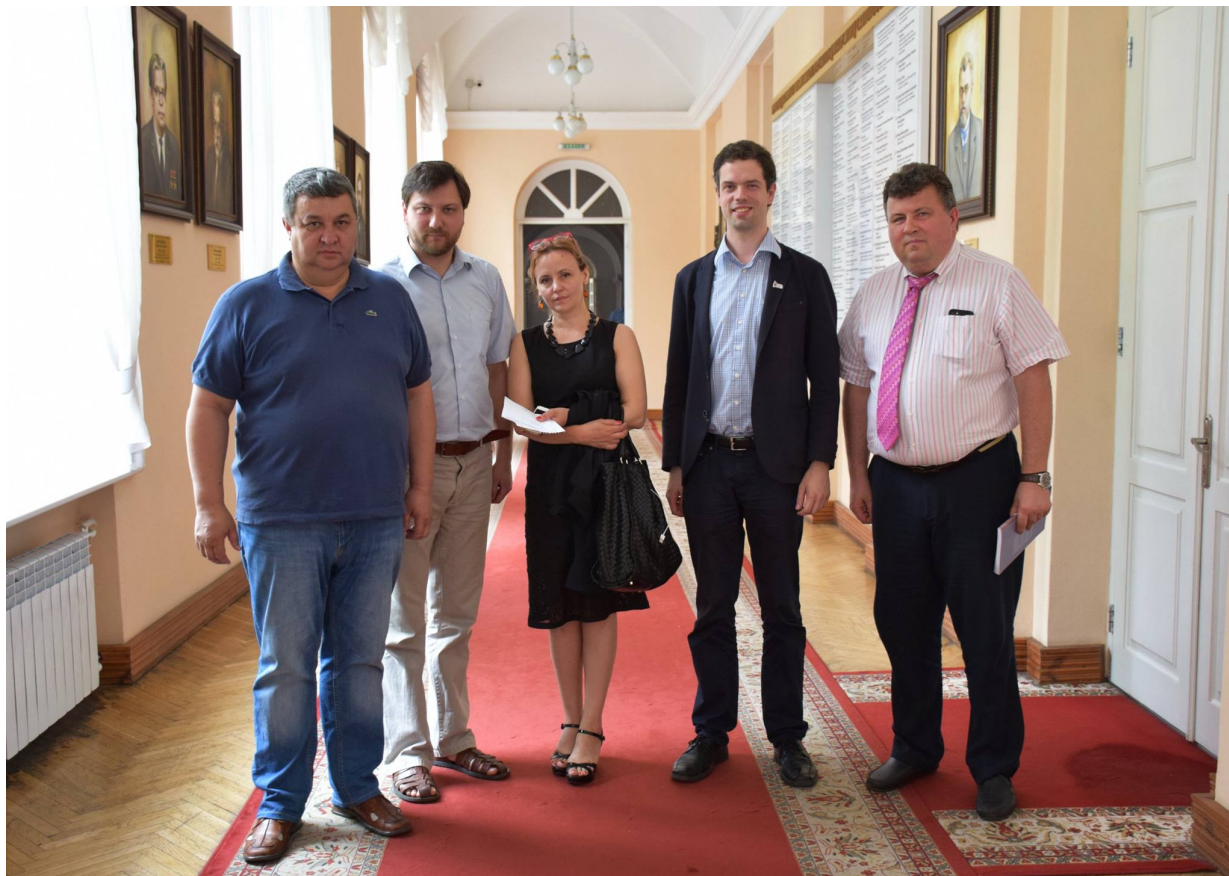
Taras Shevchenko National University

Both in Lviv and Kiev plans are ripening to get to work with Servais' music and in both cities one is interested in further investigation of Servais' presence.