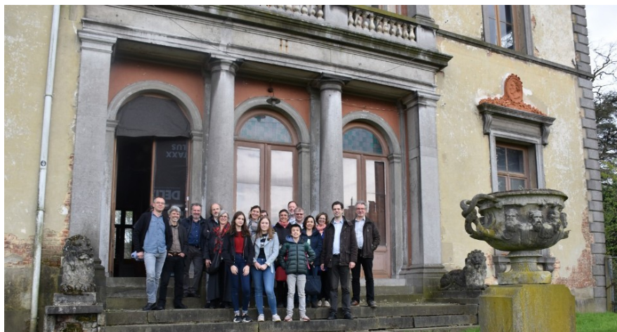
Visit to the Villa Servais