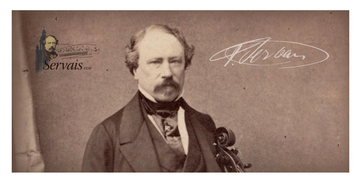
Newsletter Servais Society n°39-40 - May-June 2017