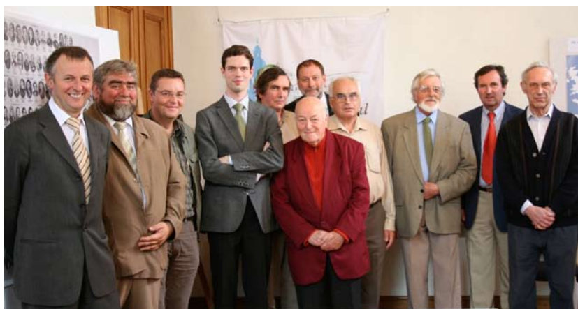
July 6 : vernissage of the exhibition

exhibition in the Zuidwestbrabants Museum can still be visited in July and August on Saturdays from 2 to 5 PM and on Sundays from 10 to 12 AM and 2 to 5 PM.