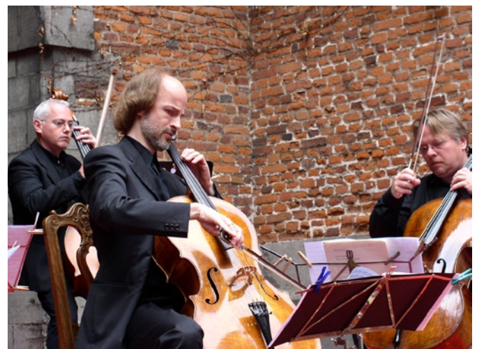
The Rosamunde Ensemble as guests at the Ecaussines Castle.