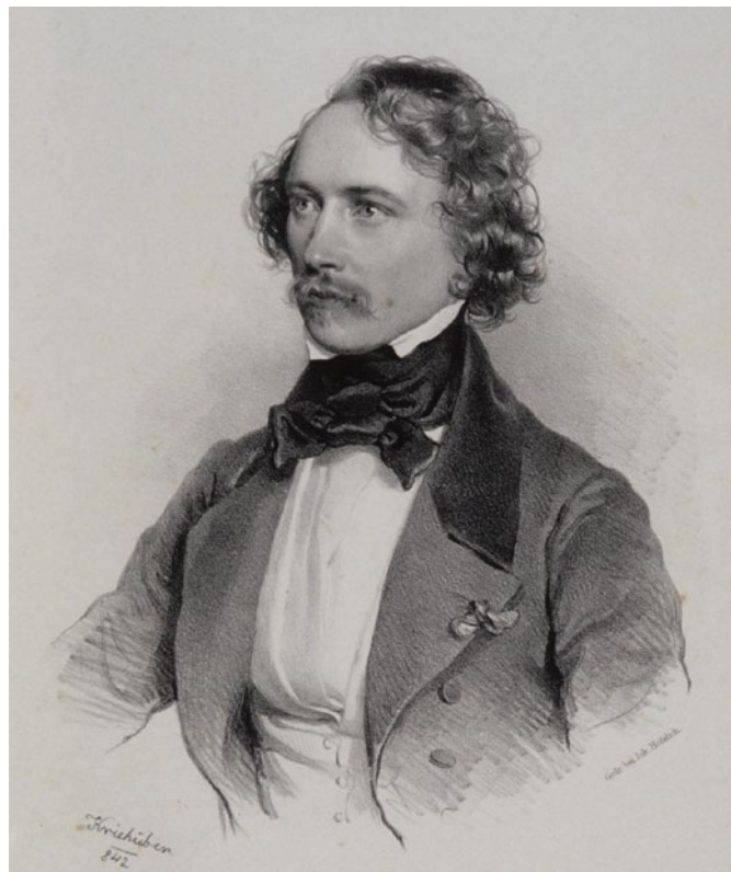
The better known portrait of François Servais by Josef Kriehuber, Vienna, 1842

So far no fewer than thirty-three different pictures of Servais have been discovered: two paintings, two engravings, nine drawings and water colors, eight lithographs and twelve photographs. Who will be the finder of the thirty-fourth picture?