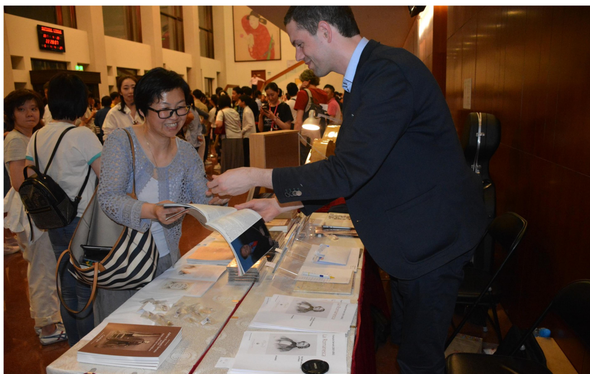
Promotion of Servais in Beijing