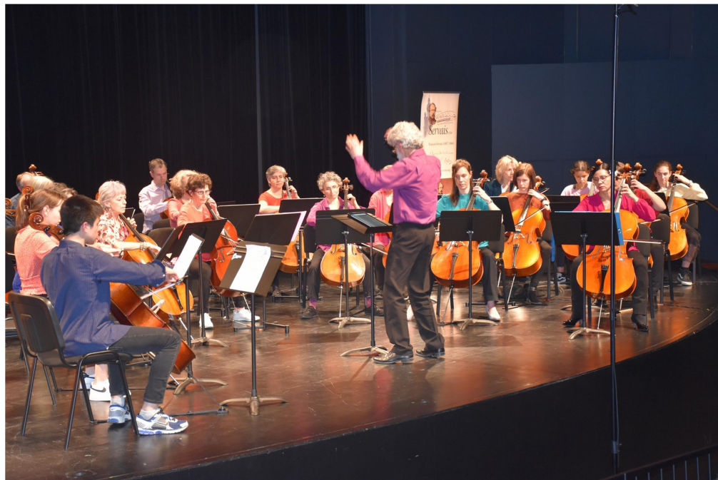
Final concert Cello Four Days April 16, 2022